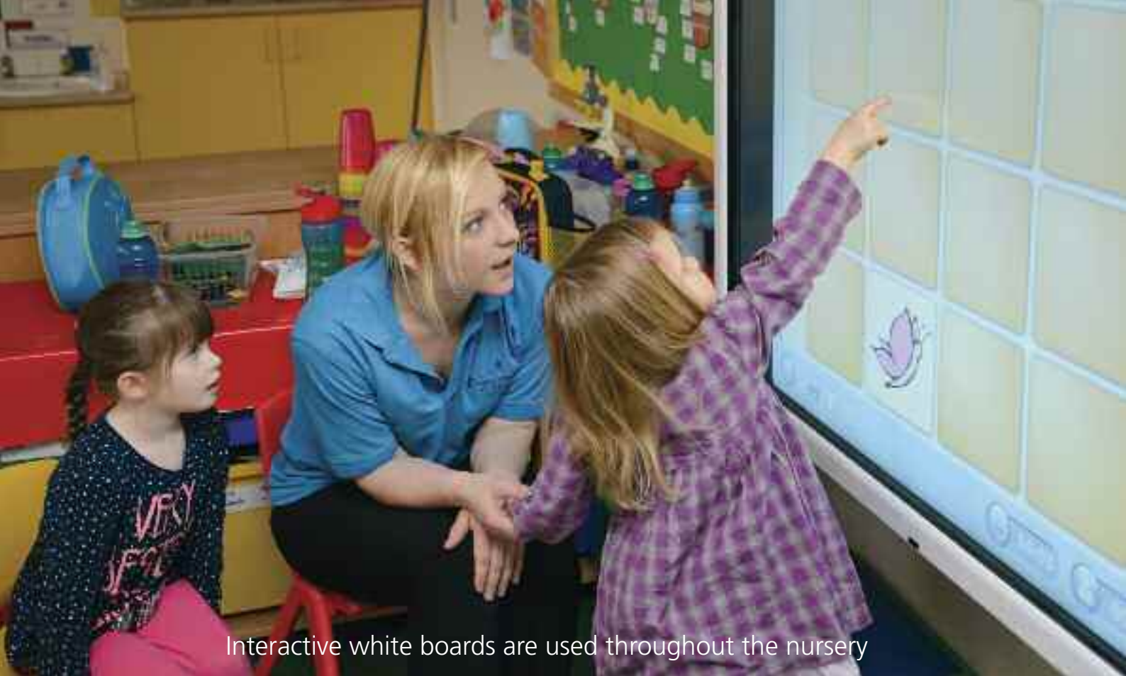
Interactive white boards are used throughout the nursery

We have a carefully planned range of activities based around the Early Years Foundation Stage (EYFS) which is intended to prepare children for when they transfer to reception class or their local school. Listed below are the key areas of learning.